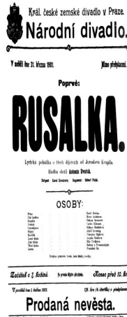
The poster for Rusalka premiere, 31 March

Act 1 Rusalka the water nymph tells her father, Vodnik the water goblin that she has fallen in love with a human Prince who hunts around the lake. He tries to warn her off and sends her to a witch Jezibaba. She sings to the moon about her love and the witch tells her that loving him will make her lose speech and mortality and if he doesn't love her